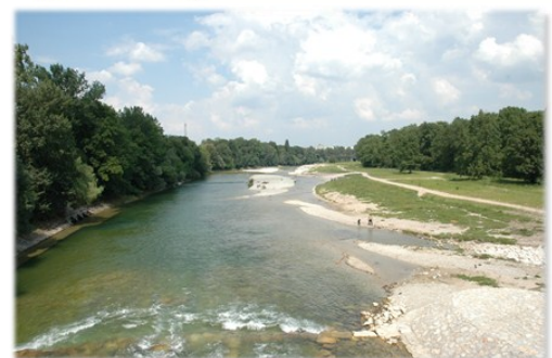
River Isar restoration through Munich (planform design & photo post restoration)