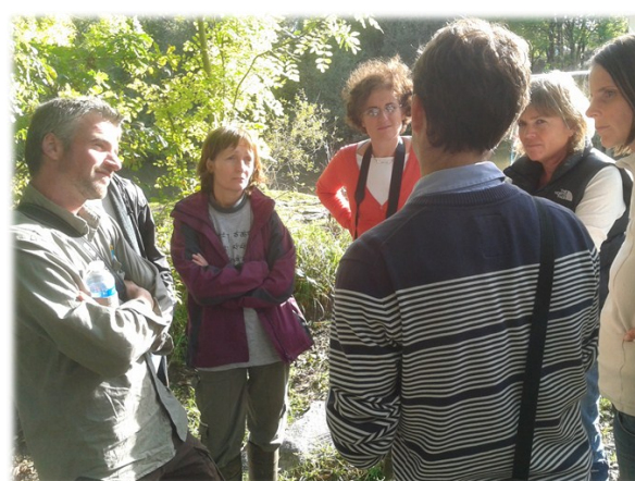
Discussions during the RESTORE field visit to restored sites in the Loire Valley, October 2012

Return booking forms to RRC as soon as possible as places are limited. Attendance at both is free (including lunch and travel between sites) however you will be expected to pay for your accommodation.