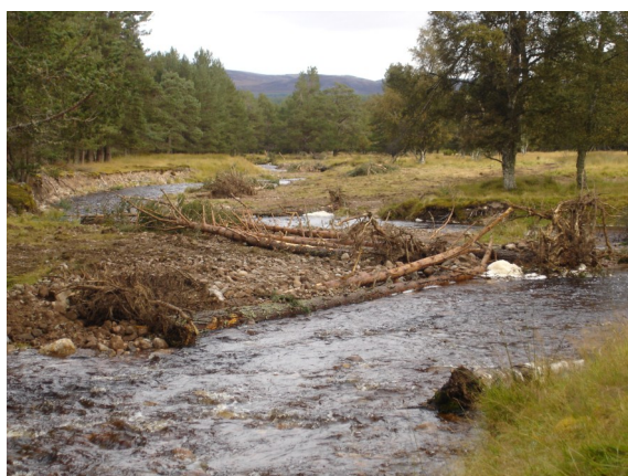
Boulders on the left bank bar have been replaced with trees to increase ecological value

The Spey Fishery Board in Scotland have recently undertaken a river restoration project on the Allt Lorgy, a tributary of the River Dulnain in the Spey Catchment.